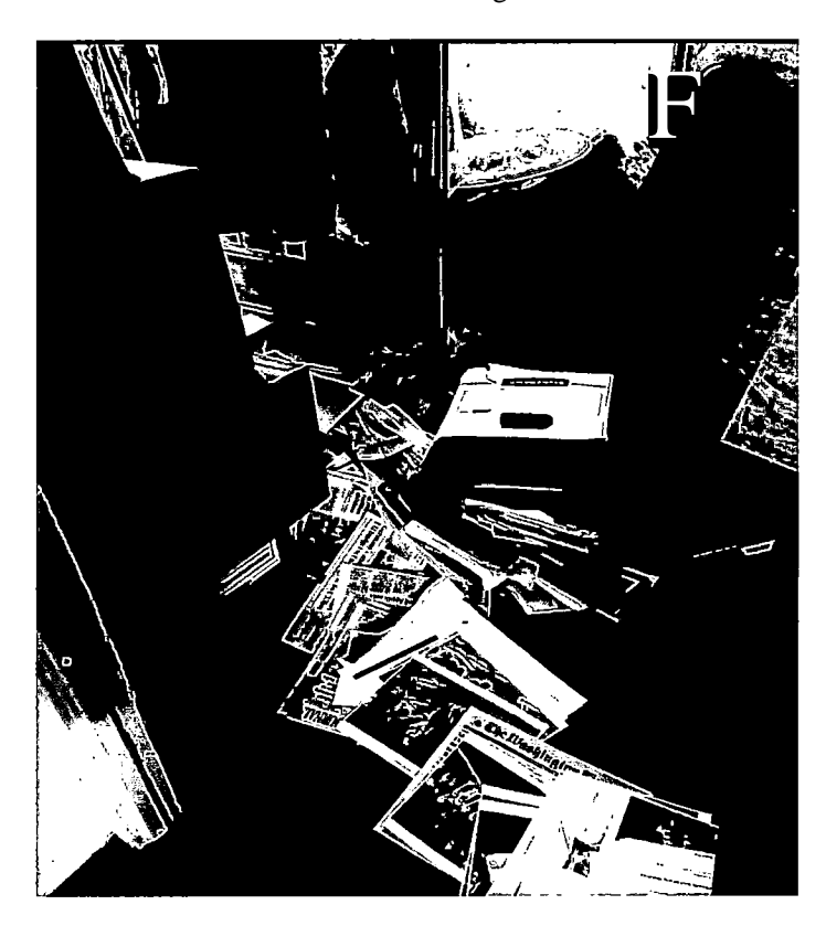
TRUMP's Disclosures of Classified Information in Private Meetings

TO USA, FVEY," which denoted that the information in the document was releasable only to the Five Eyes intelligence alliance consisting of Australia, Canada, New Zealand, the United Kingdom, and the United States. NAUTA texted Trump Employee 2, "I opened the door and found this..." NAUTA also attached two photographs he took of the spill. Trump Employee 2 replied, "Oh no oh no," and "I'm sorry potus had my phone." One of the photographs NAUTA texted to Trump Employee 2 is depicted below with the visible classified information redacted. TRUMP's unlawful retention of this document is charged in Count 8 of this Indictment.